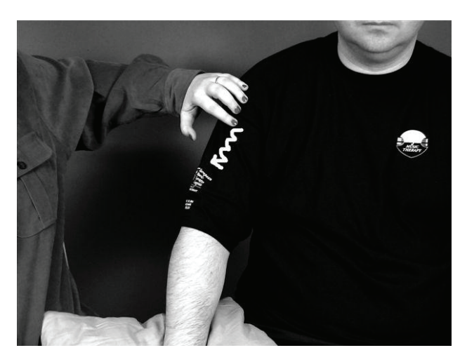
Fig. 1. Musical haptices when sitting side by side (Reprinted with permission from Lahtinen & Palmer, 2005)