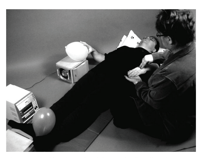
Fig. 2. Musical haptices when lying on the floor listening to pre-recorded music (Reprinted with permission from Lahtinen & Palmer, 2005)